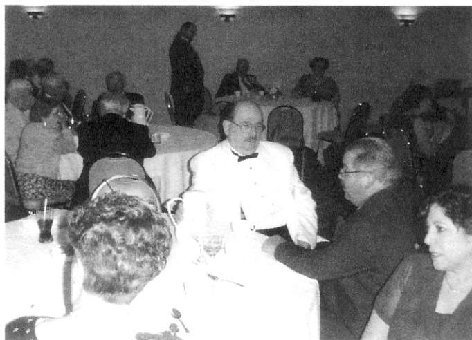
More from our Interlodge Dinner Party